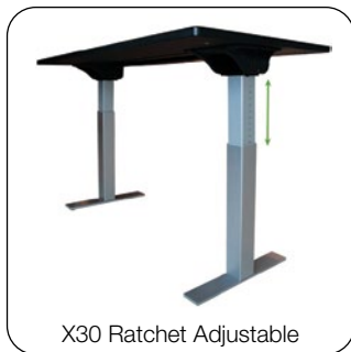
X30 Ratchet Adjustable