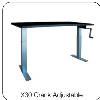
X30 Crank Adjustable