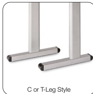
C or T-Leg Style