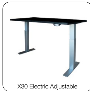
X30 Electric Adjustable