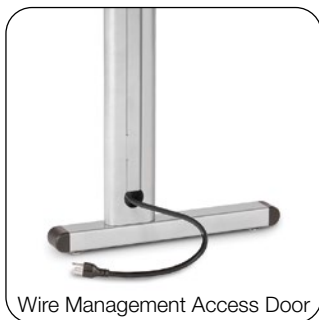
Wire Management Access Door