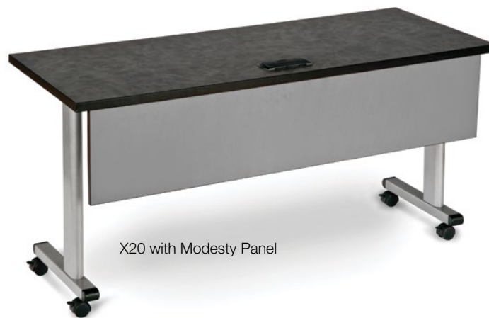
X20 with Modesty Panel

PEDESTAL: Silver, Black, Anthracite, Almond, Champagne, Taupe or Charcoal